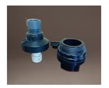
Option 2: Remove all parts except the bulkhead and glue 1-1/2" pipe into the bulkhead fitting.

Remove the assembly on the left and work with just the bulkhead fittings, shown on the right. This option gets rid of the screen and gives you a 1-1/2" drain pipe.