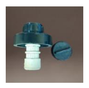
Option 1B - Remove the white screen prior to installation of W22392 to increase flow

The white screen is in place for preventing traditional filter media (sand, glass beads) from draining out the bottom, allowing only the water to exit the tank. If collection of sludge-y material is expected with ProMoss™ use, removal of this screen will aid the draining process.