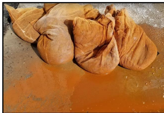
Used bags of ProMoss show the iron that has been absorbed from the loop water.